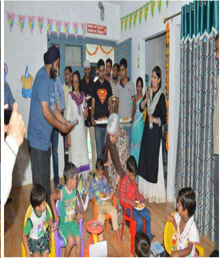
CHIEF GUEST DISTRIBUTING SWEET TO WOMEN WORKERS & THEIR KIDS